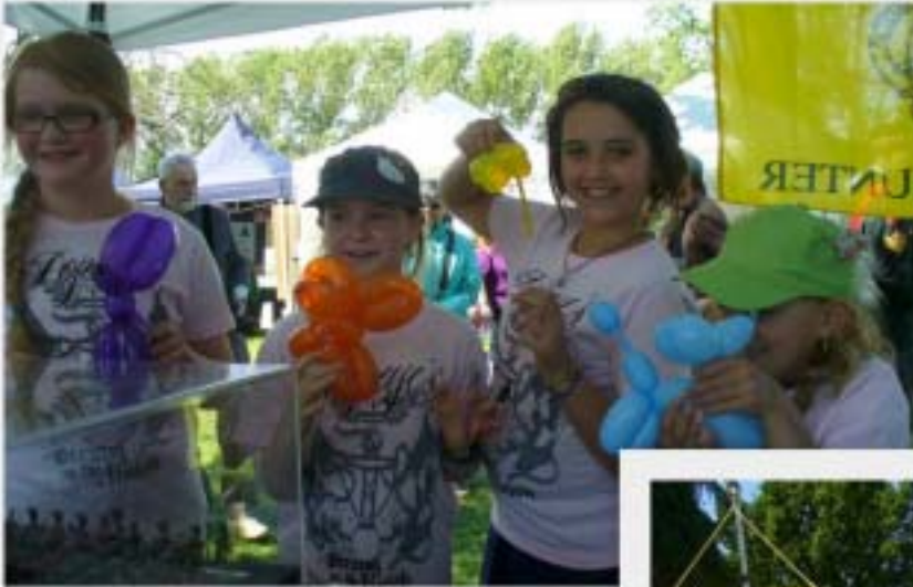
Left: Young visitors admiring the "Hundred Pipers" display at the Hunters' tent at the Victoria Highland Games