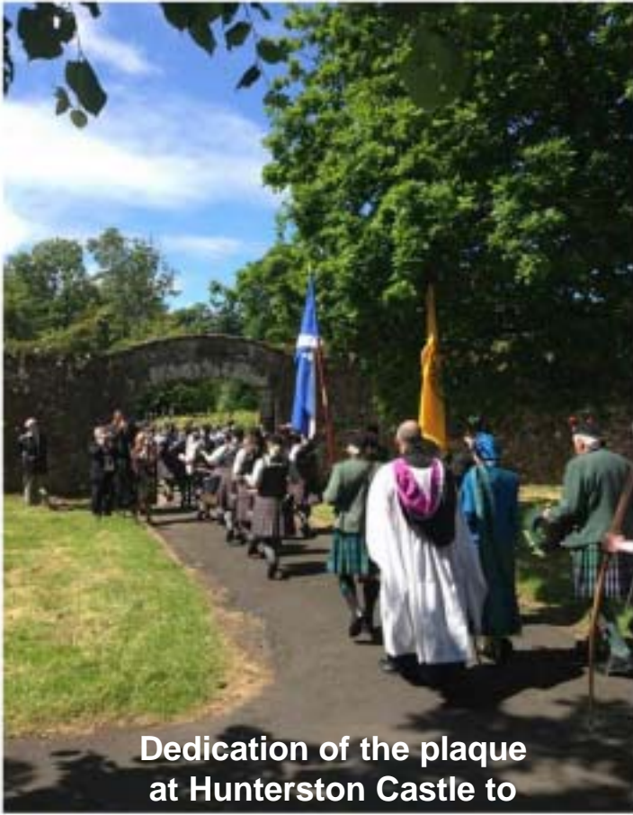
Dedication of the plaque at Hunterston Castle to