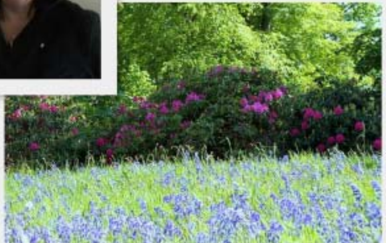
Right: Bluebells and Rhododendrons on display at Hunterston Castle.