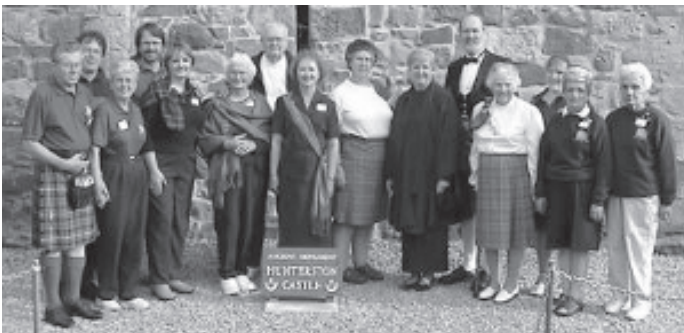
Above: Here are some of the Canadian Contingent getting ready for the Ceilidh