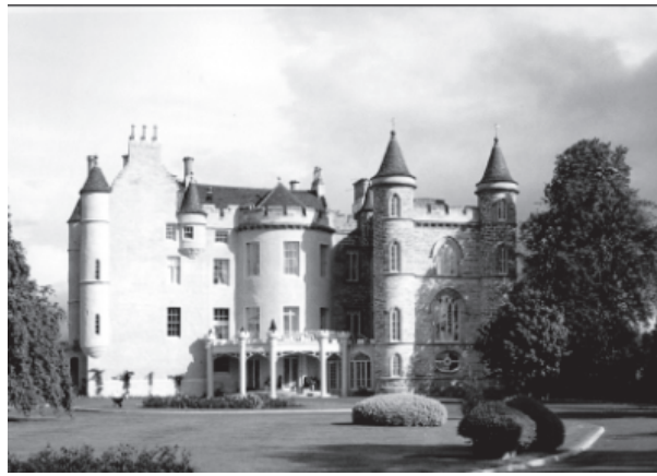
Balnagown Castle Ancient Seat of Clan Ross